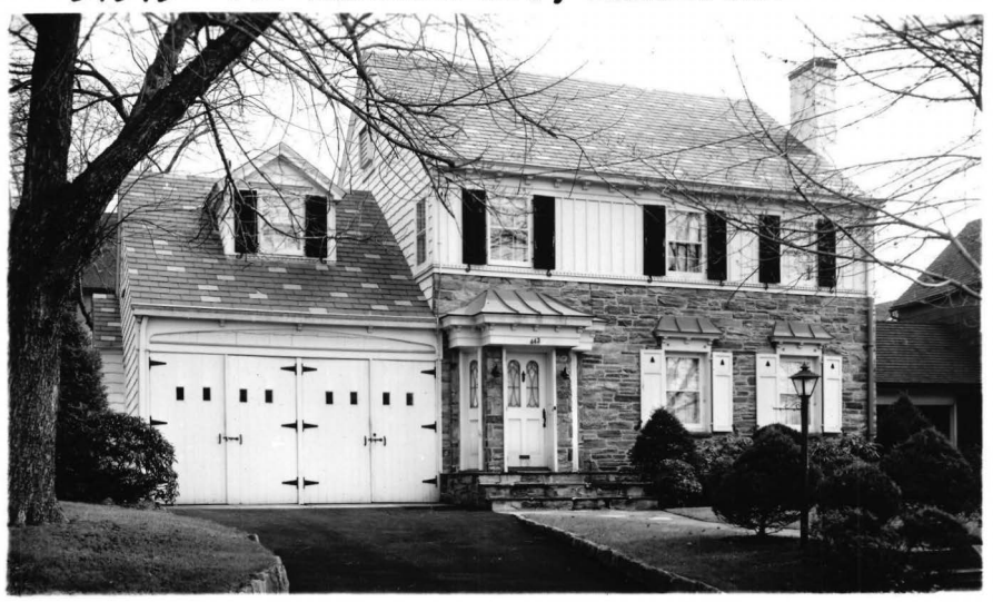
Board of Realtors of the Oranges and Maplewood